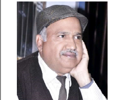
By: Vijay Garg

"The problem of malnutrition even among domestic women"