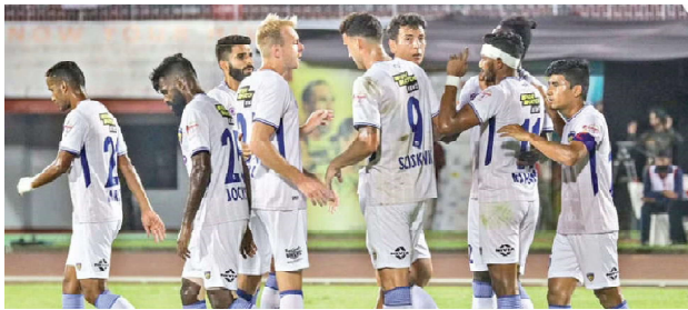
Chennaiyin FC players celebrate after scoring a goal